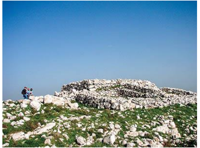
2) Site reconstruction