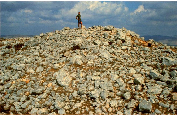
1) Site when discovered on April 6, 1980