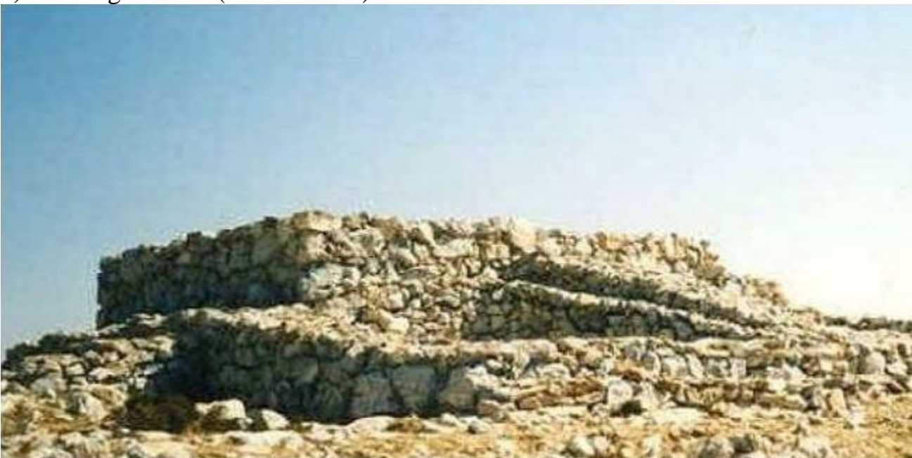
4) The reconstructed altar